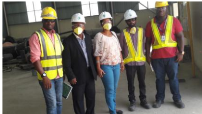
Test Audit Nov 2016