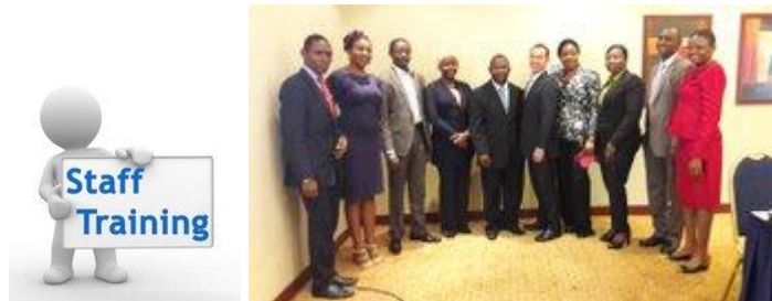
Sustainability / CSR Training, Protea Hotel Lagos

In partnership with PECB Canada, Sustainability and CSR Insights UK and Arche Advisors USA, we provide a range of CSR training for all levels of CSR practitioners all around Africa. All training programs can be tailored to address your organization’s specific needs, certified and may be delivered in-house at a very competitive rate.