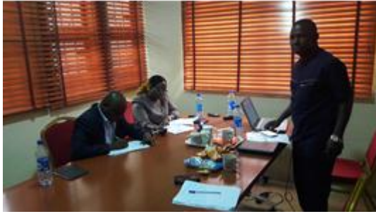
Central Bank of Nigeria Sept 2017

This is more focused CSR training designed to enable participants acquire the skills and competences required to become CSR regulators and practitioners in the public sector through specialized, detailed and interactive classroom setting and review of CSR case studies from around the world. It provides participants with the tools and necessary practical CSR framework to function as CSR managers in MDAs and other regulatory agencies. Emphasis will be on Oversight, Policy Formulation and Implementation, Reporting and Communication.