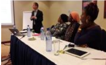
May 2016 Session

Any person involved with/responsible for SDGs